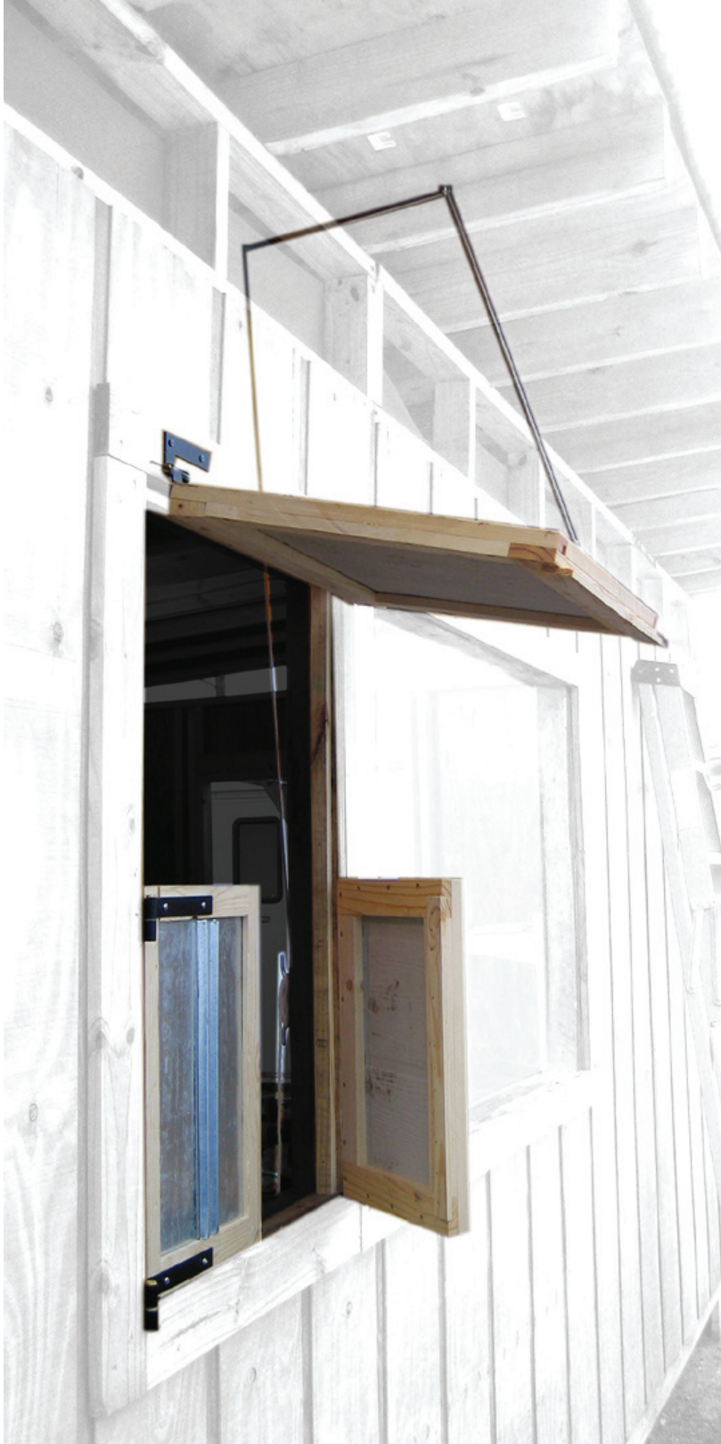
Shutters in Open Position