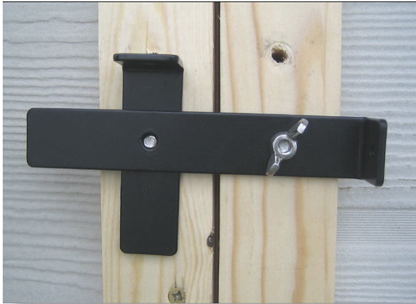
Exterior Closing (center)